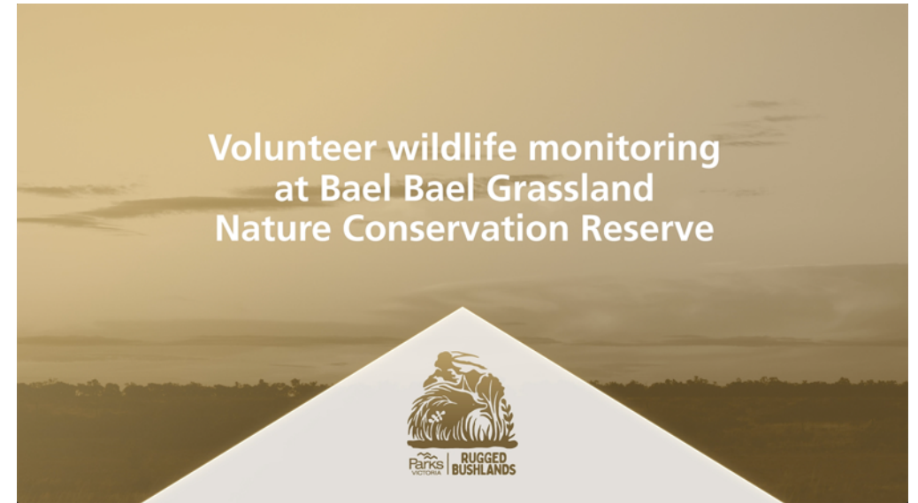
Opening titles - Experience brand rugged bushlands