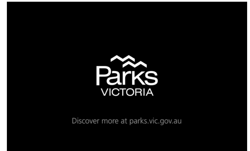
PV masterbrand final slide with default CTA.