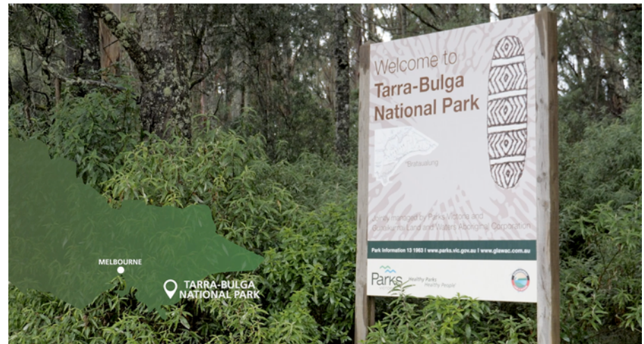
Map of Victoria – Experience brand Tall Forests