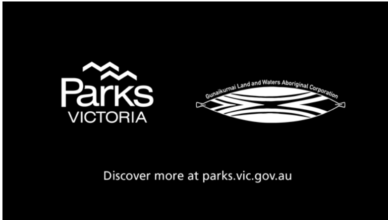
GLaWAC and PV cobranded final slide.