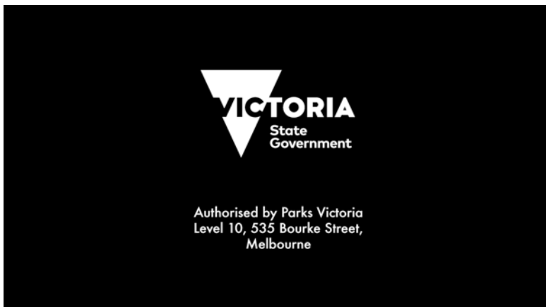
VicGov authorized slide - note this is mandatory and is supplied.