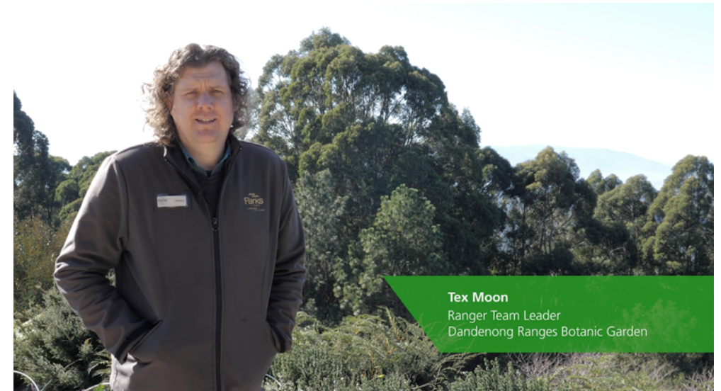
PV Masterbrand lower-third